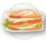
Ziploc & other reclosable food storage bags