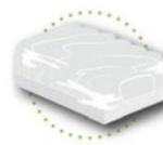
Wood pellet bags